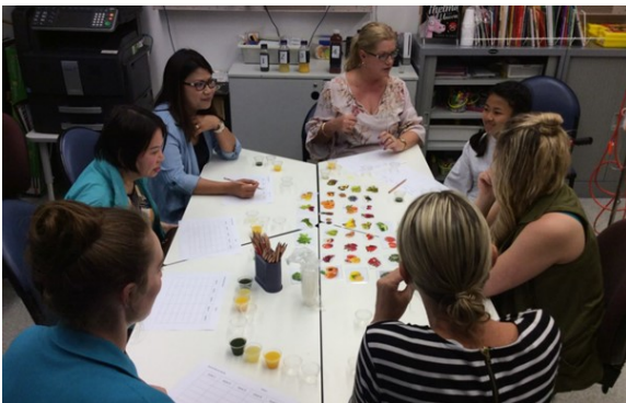
And on our "Right to be Healthy" Day we did blind taste-testing of fruit and vegetable juices!