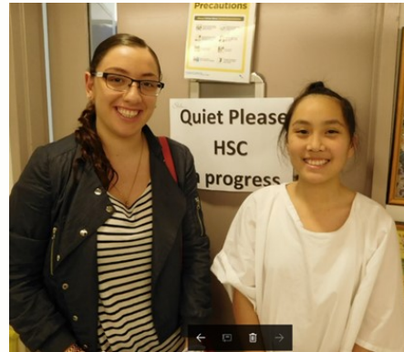
We even had a HSC student sit her English exam with a NESAP Presiding Officer whilst in hospital.

Liverpool Hospital School would like to wish everyone a very Merry Christmas and a long, relaxing holiday!